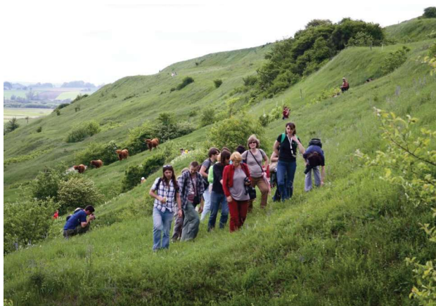
Dobuzek site excursion.