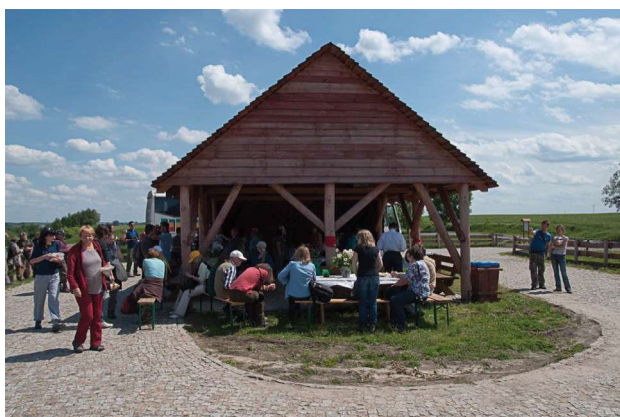
Refreshment in the vicinity of village Czumów.