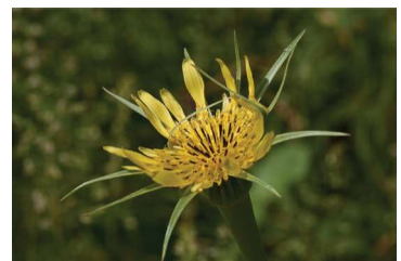
Presymposium excursion: Iwona Dembicz and Łukasz Kozub (the organizers) and participants during the wet and cold spring days. Flowers on the right side (from up to down: Armeria maritima subsp. elongata , Astragalus arenarius , Saxifraga granulata , Chamaecytisus ruthenicus , Verbascum phoeniceum , Tragopogon dubius .