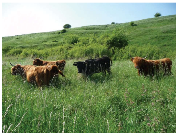
Cow grazing in Dobuzek site.