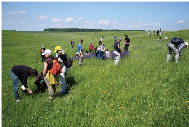
Participants of excursion to Popówka site.