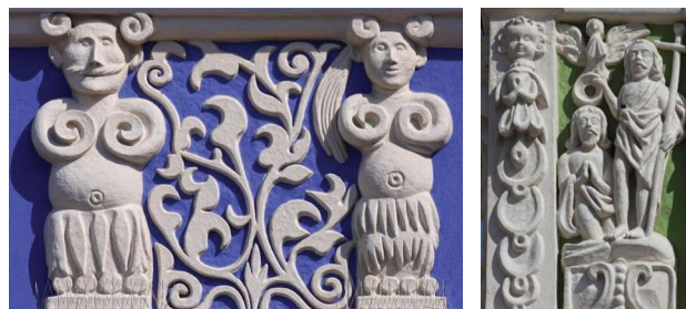
Guided tour through Zamość Old Town (left) and the decoration of Armenian merchant houses (above).