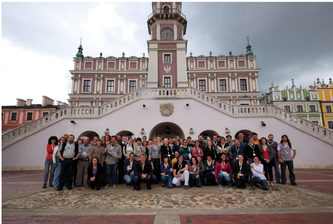
Participants of the meeting on the main square of the Zamość.

On 24-31 May, the 10th European Dry Grassland Meeting took place in Zamość, Poland. Previous meetings were organized in Germany (Lüneburg, Münster, Freising, Kiel, Halle), Slovak Republic (Smolenice), Ukraine (Uman') and Greece (Prespa). The conference was organized within the framework of EU LIFE project LIFE08NAT/PL/000513 “ Conservation and restoration of xerothermic grasslands in Poland – theory and practice ” project implemented by the Naturalists' Club and Regional Directorate for Environmental Protection in Lublin, financed by European Union funding instrument LIFE+ and National Fund for Environmental Protection and Water Management.