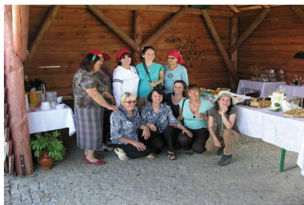
Team of cooks and eaters.