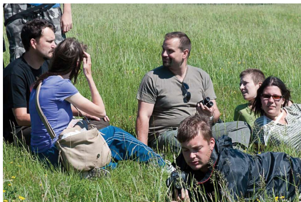
Excursion to Popówka.