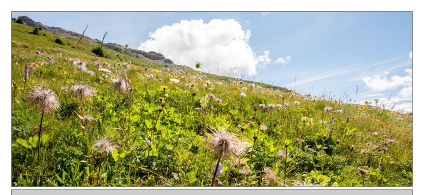
Sub-alpine grassland in the southwestern Dolomites.

We invite all participants to present their research outcomes in a short oral presentation (15 min incl. discussion) or with a poster (incl. a three-slide short presentation). As already practised in previous EGCs, oral presentations of scientific results and on non-scientific activities (such as conservation management) on the topic of grasslands will be given in several thematic sessions. The large-format posters will be exhibited in the fover of the Eurac main building. In addition to the printed poster, a short presentation should be prepared. The poster should be presented briefly with a total of three slides and a maximum of 3 minutes. The slides should NOT be identical to the poster but represent a kind of graphic abstract: Slide 1 briefly presents the topic and the background of the research. Slide 2 presents the methods and the study site. Slide 3 presents the results of the research work. There will then be an opportunity to ask guestions. The maximum time for the presentation including discussion is 5 minutes.