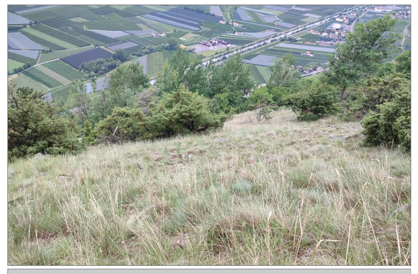
Steppe-like grasslands with Stipa capillata next to Juval Castle in the Vinschgau valley, from the EDGG Field Workshop 2023.

Young investigator prize: As in previous years, prizes will be awarded to young scientists for excellent presentation of their research (orally or in poster form). For these purposes, early career scientists (less than 35-year-old) will be asked during registration if they wish to participate in the contest. During her/his presentation, the applicant needs to explain clearly her/his contribution to the work.